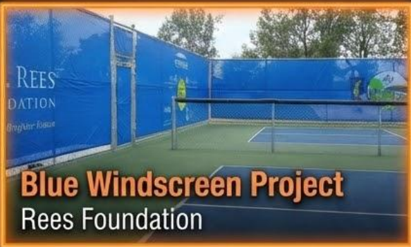
Blue Windscreen Project Rees Foundation