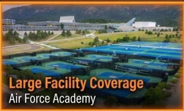
Large Facility Coverage