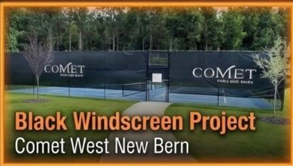
Black Windscreen Project Comet West New Bern