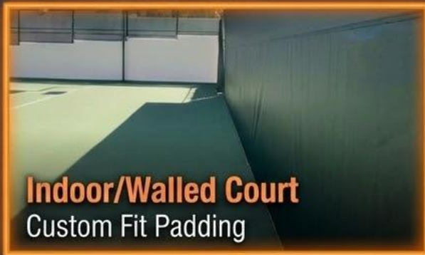
Indoor/Walled Court Custom Fit Padding