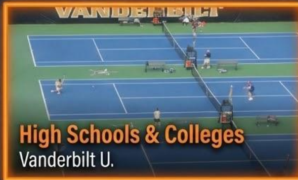
High Schools & Colleges