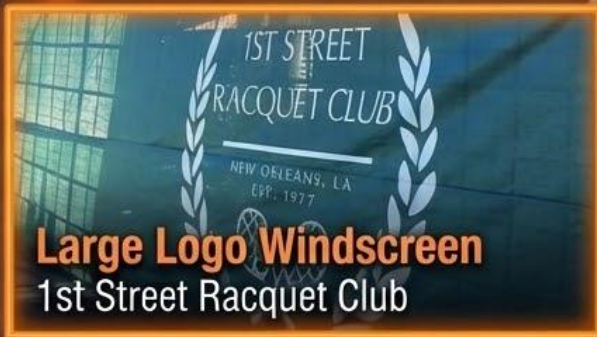
Large Logo Windscreen 1st Street Racquet Club