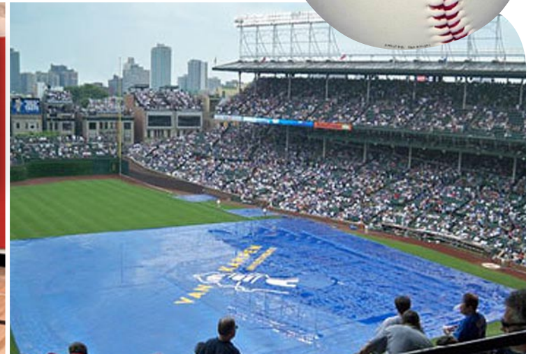
Athletic Field Covers and Safety Padding

From design to installation, let our experienced professionals listen to your needs.