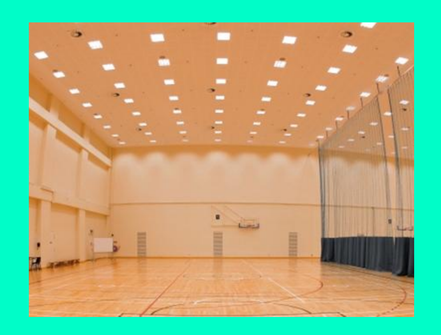
Custom fabricate to any dimensions.