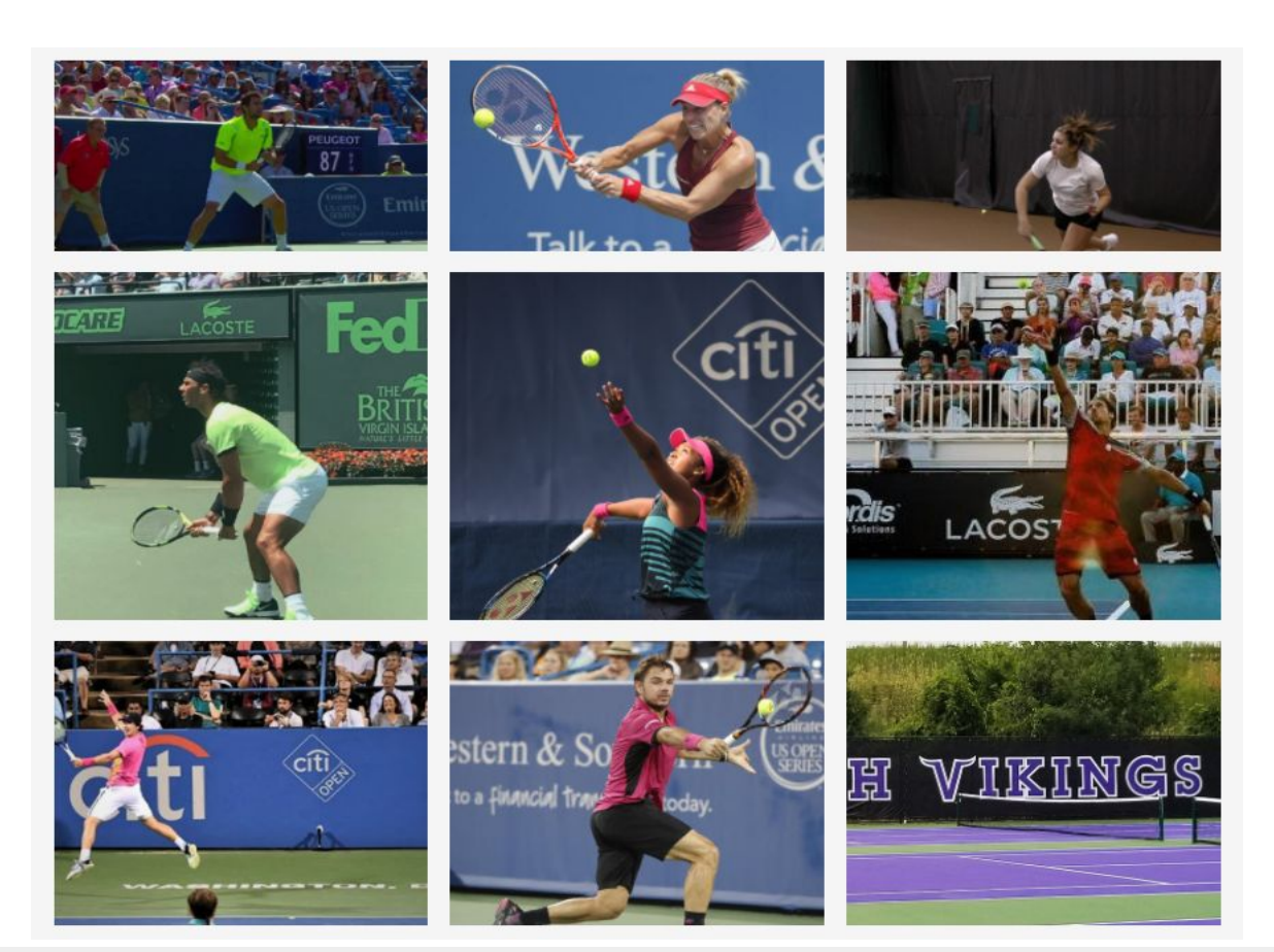
5 YEAR 'NO FADE' PRINT WARRANTY ON CUSTOM TENNIS WIND SCREENS