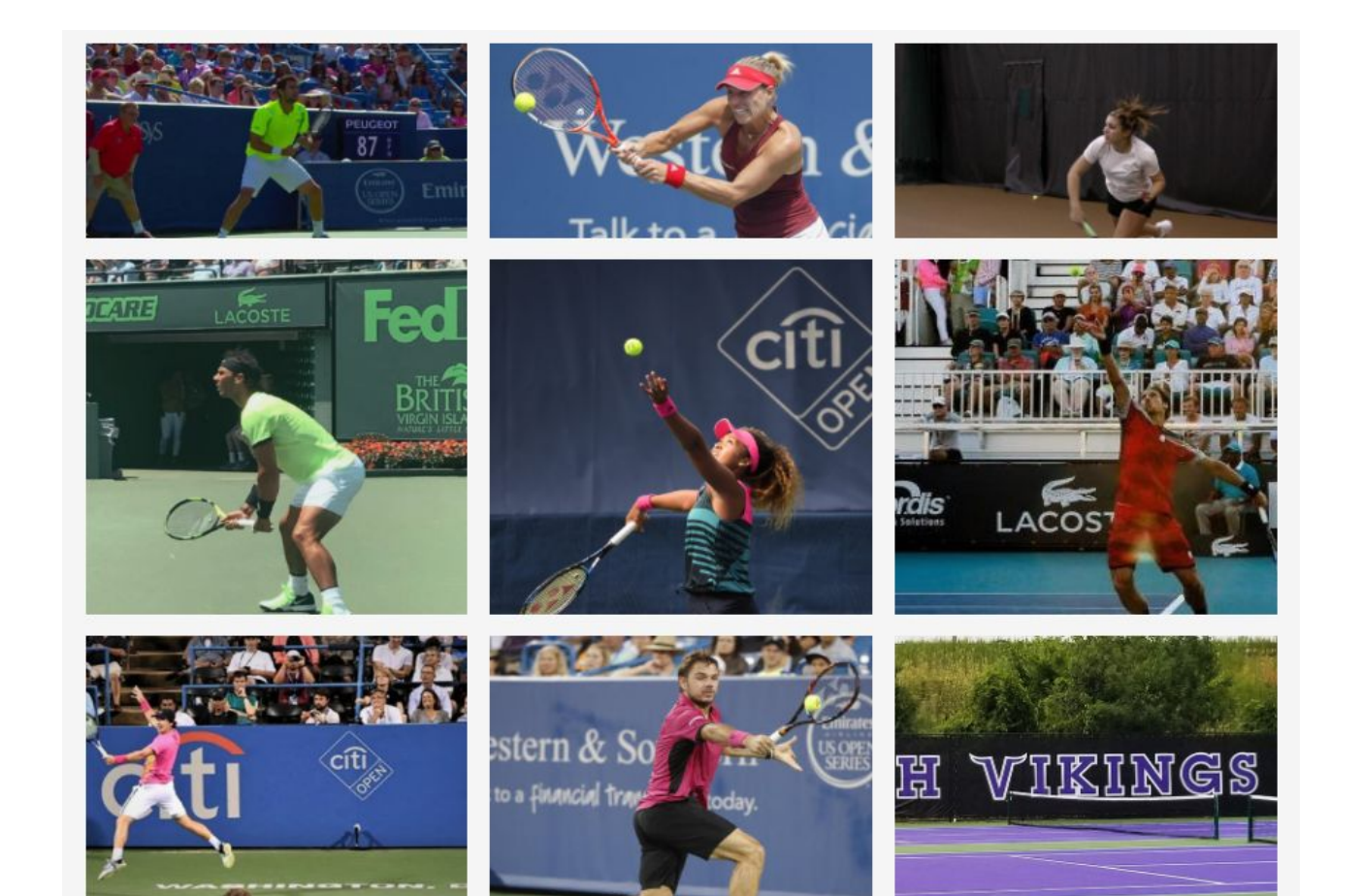
5 YEAR 'NO FADE' PRINT WARRANTY ON CUSTOM TENNIS WIND SCREENS